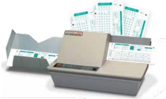
TSM 888P+ Scanner

Customize Scantron forms to meet the needs of virtually any survey or data collection project with formats including single sheets, self-mailers, business reply cards, multi-page booklets, or carbonless and continuous-feed forms. Scantron's technical expertise and state-of-the-art printing equipment ensure specific registration requirements and use specialized paper manufactured to exacting weight, stiffness, finish and erasability standards to guarantee accuracy.