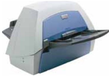
iNSIGHT 30 Scanner

From traditional Test Scoring Machine and Optical Mark Read (OMR) scanners to the iNSIGHT line of combined OMR and imaging scanners, we offer the top quality hardware that you would expect from Scantron.